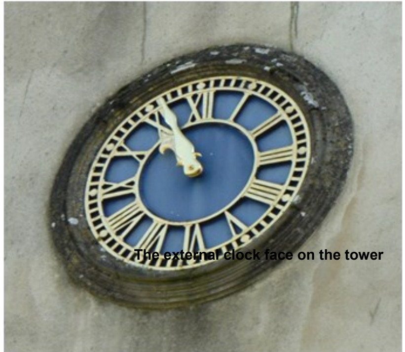
The external clock face on the tower

The clock is a "Jubilee Clock" bought for the church to celebrate the Diamond Jubilee of Queen Victoria. It cost £120 when installed and although the exact date it was fitted is not known, Queen Victoria's Diamond Jubilee (60 years) was in 1897. The cost of the latest repair work was £610 + VAT.